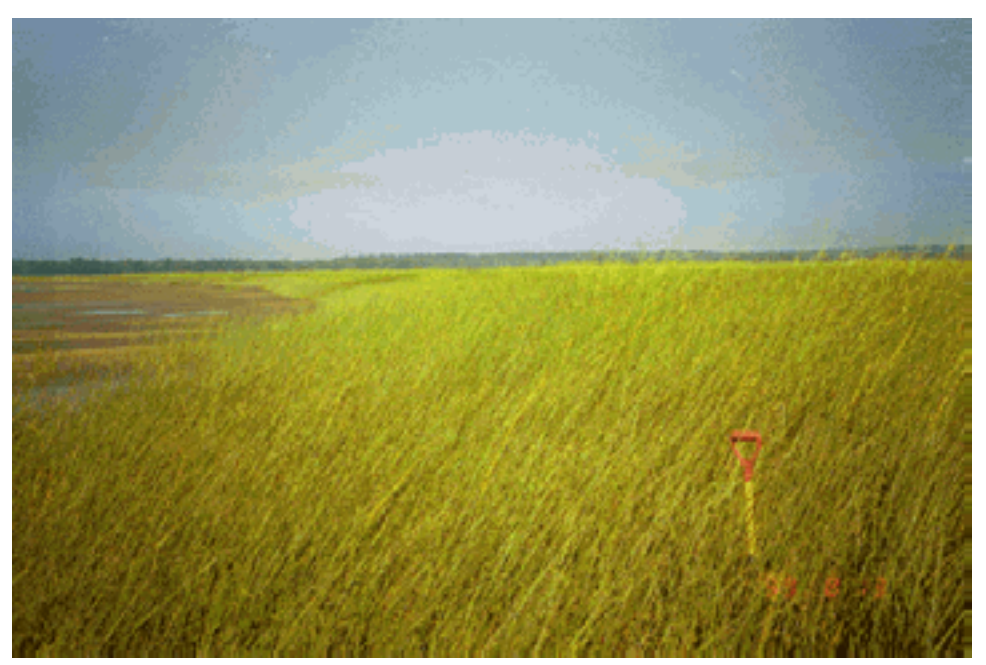
Photos 15, 16. View facing west from within softstem bulrush wetland. Three square is present near the left side (water edge) of picture (above). Sofstem bulrush in flower (below).