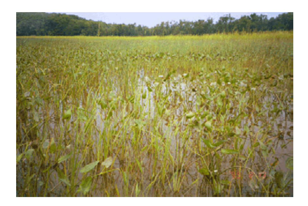
Photo 17. View facing north from south edge of mixed wetland. Wild rice wetland is visible in background.