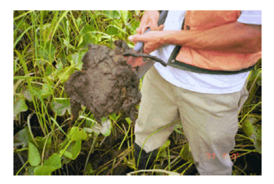
Photo 7. Dark gray silty sand with some organic accumulation and many roots/rhizomes is substrate. Some soft rush, wild rice and river bulrush interspersed with pond lily in this photo.