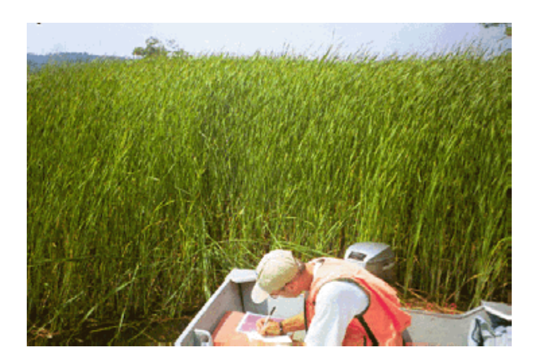
Photo 11. View facing west. This is typical dense monotypic stand of cattail. Few if any short-stature emergents can be found beneath this dense growth.