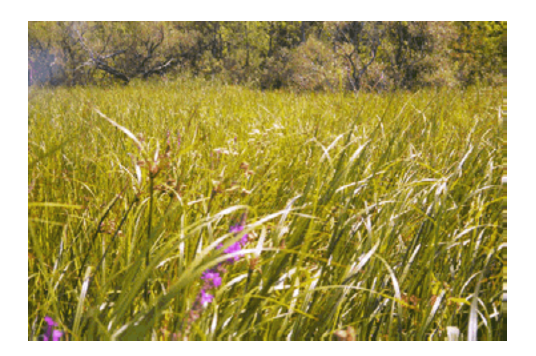
Photo 4. View to east from the interior of the reference wetland. Purple loosestrife is visible in the left foreground. The inflorescences and dark green foliage in the foreground and background are river bulrush. The white in the center of the picture is water parsnip.