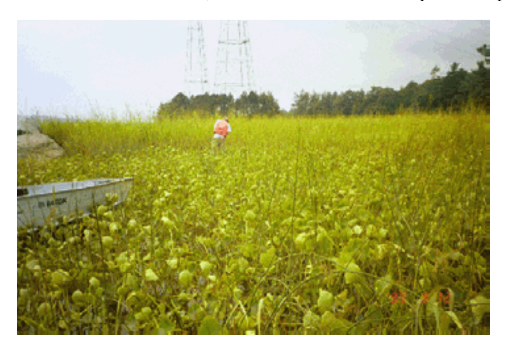
Photo 8. View facing south from northern edge of wetland. Wild rice is the cover type in the background.