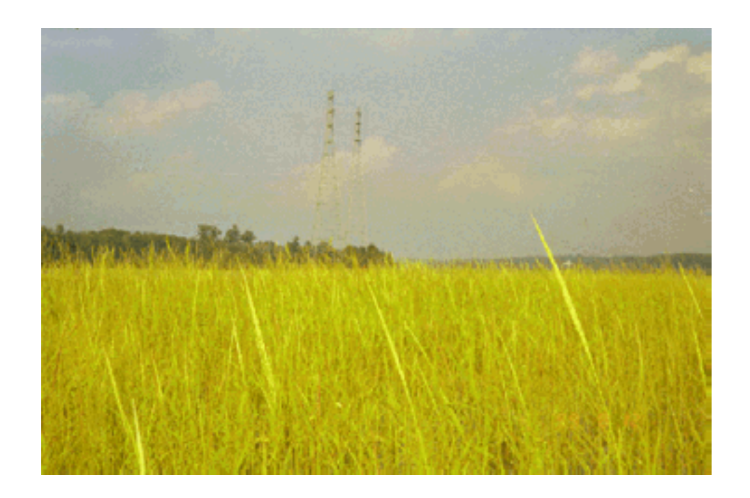
Photo 13. View facing north towards utility ROW at Abagadasset Point from wild rice wetland interior.