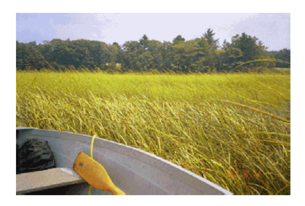
Photo 9. Sweet flag wetland is in foreground adjacent to boat. Wild rice wetland in background beneath upland forest.