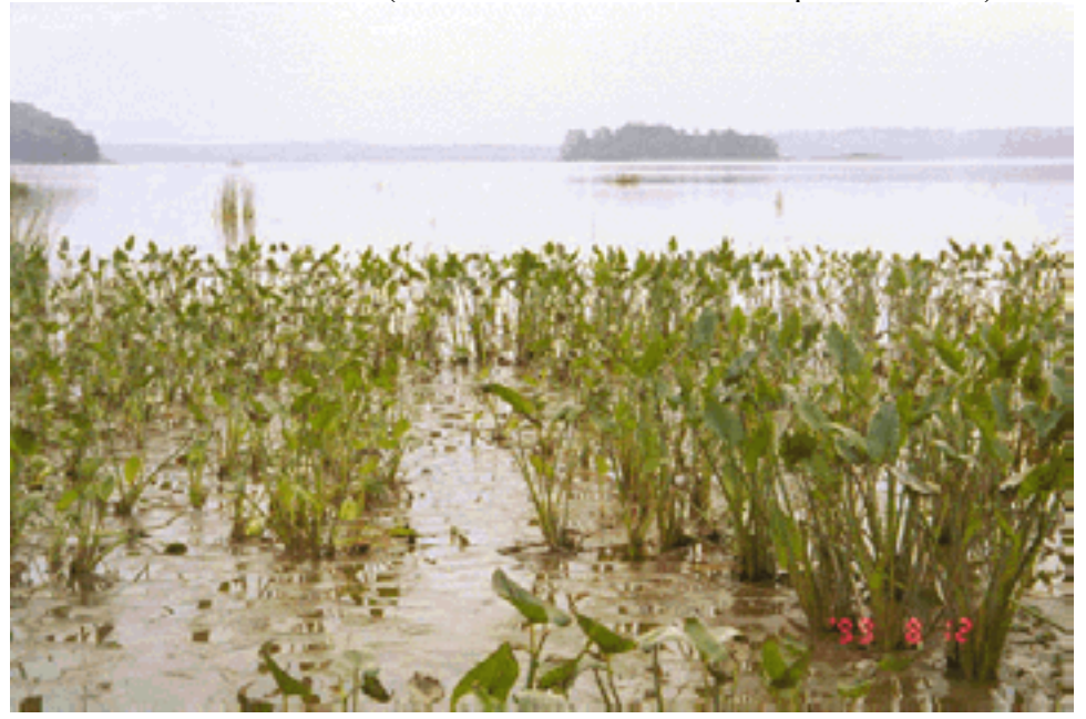
Photo 6. View facing east from north edge of wetland towards Brick Island. Some parts of this wetland have 50% or less vegetative cover, but overall it was estimated to have a total % areal coverage of 80%.