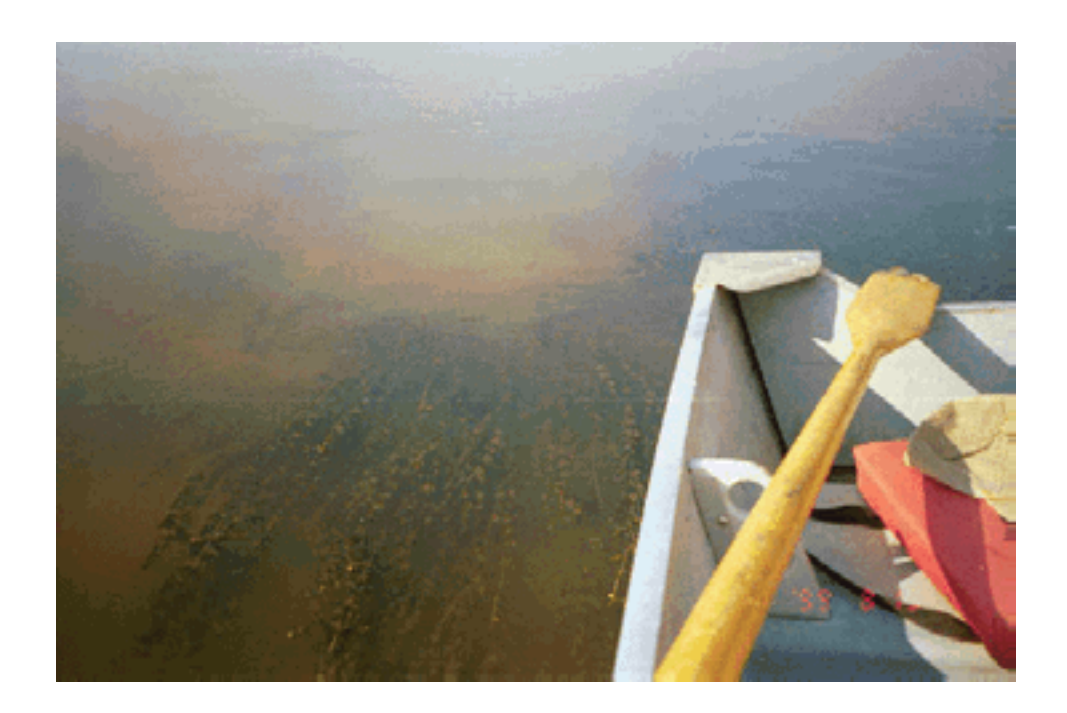
Photo 1. Clasping-leaved pondweed within about one foot of low tide. Patches of this species were interspersed with patches of tapegrass (below).