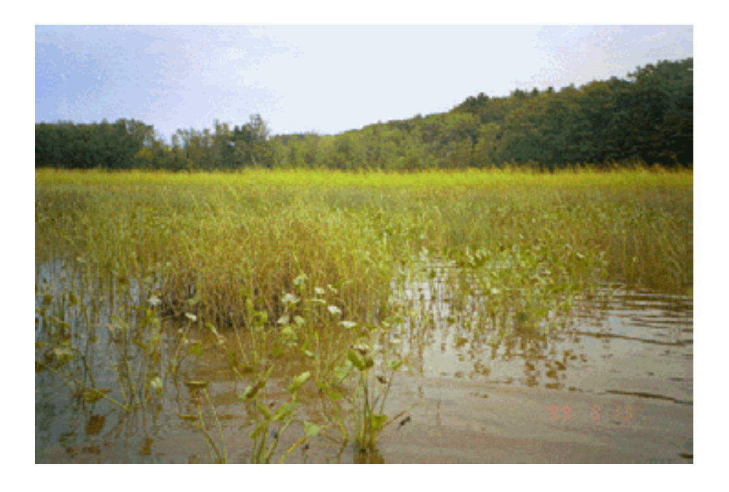
Photo 18. View facing northwest between low and mid tides. A clump of river bulrush is in left center with pickerelweed in foreground and a clump of sweet flag in far right-center.

J:\816-001 Merrymeeting Bay\Reference Wetlands 04.doc