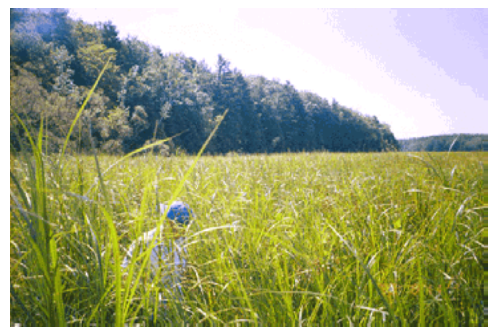
Photo 3. View to southeast from western edge of river bulrush reference.