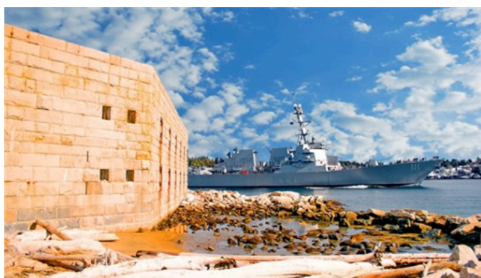
Figure 1: The U.S.S. Spruance seen leaving the mouth of the Kennebec River at Fort Popham on Feb. 18, 2011

In this case, however, there need be no delay. The Spruance can clearly exit the Kennebec River safely without dredging; it did so to conduct sea trials just last month as shown by the photograph in Figure 1. Thus, there is simply no need for emergency out-of-season dredging and all of the adverse impacts it would cause. The No Action Alternative is clearly practicable, less environmentally damaging, and cost effective – in fact it would save taxpayers