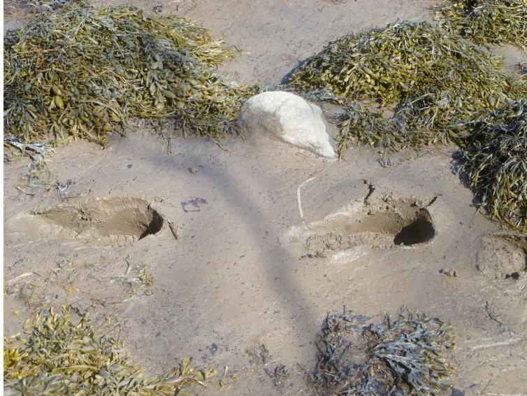
Figure 3: A thick layer of mud and muck still coats the western shore of the Kennebec Narrows approximately 17 months after being deposited from the dumping of dredge spoils in 2009

The Kennebec Narrows disposal site north of Bluff Head is a rocky deep, narrow (300 yards) channel with strong currents, eddies and upwelling. It is a critical and very biologically rich area: all the aquatic life that rides the currents up and down the Kennebec transits these narrows. Since it is a fertile fishing ground, it attracts diving ducks, birds, birds of prey and seals. Impacts to this rich aquatic environment have not been studied; nor are there any analyses of impacts to this river segment in the draft EA or Public Notice document.