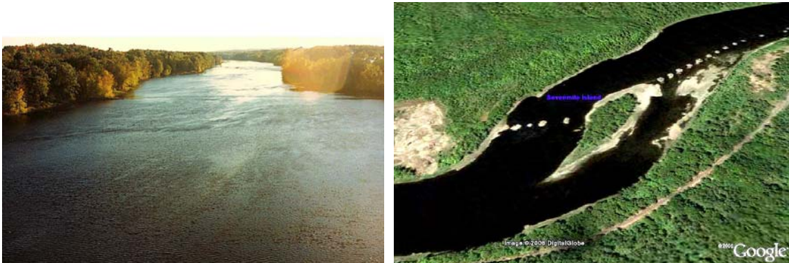
Photo 2. Typical American shad habitat in the lower Kennebec River below Waterville. Note that the river is deep, broad, and slower moving.