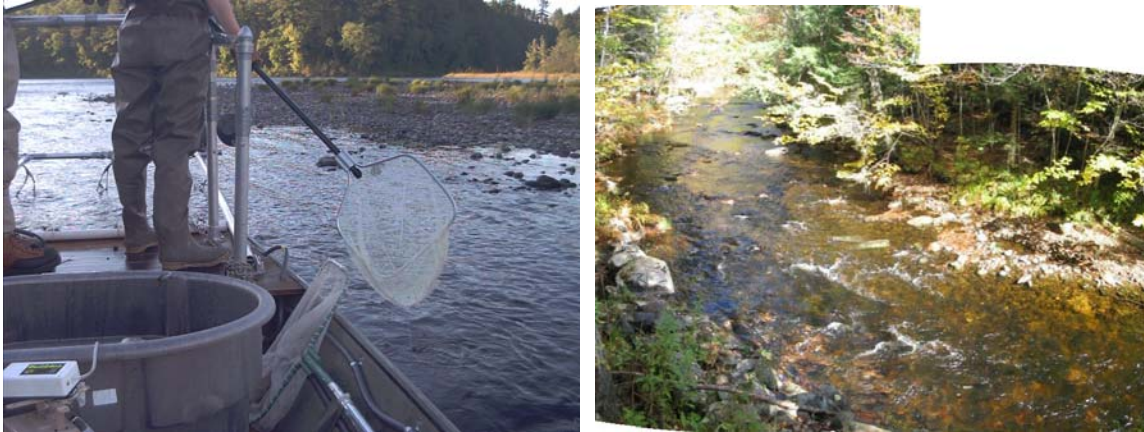
Photo 1. Typical Maine headwater Atlantic salmon spawning and nursery habitat. Note abundance of gravels, riffles and shallows.

spend the summer growing in freshwater, and depart for the sea typically no later than early November.