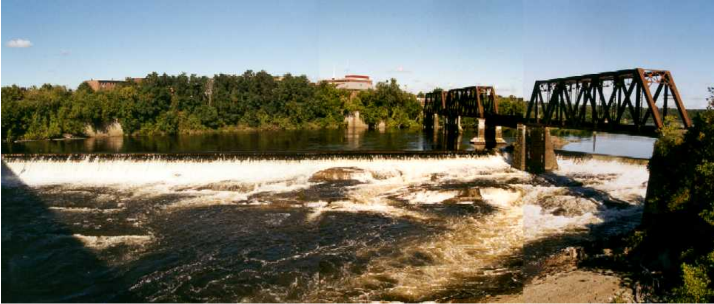
Photo 3. View of typical spillway flow at Lockwood Dam during late May, a period of peak downstream migration for Atlantic salmon.

The petitioners incorrectly allege that spillage is insignificant at these sites during the fish passage season. However, Atlantic salmon smolt migrate downstream on Maine rivers during April, May and June, with most fish passing in May (Baum 1997). During these months, flow in the Kennebec River is very high due to seasonal snow melt and rainfall. September, October and November are key months for river herring and shad downstream migration, as well as some adult salmon. During these months, spillage is variable but also occurs; any time that river flow exceeds the hydraulic capacity of the turbines the excess water passes around the powerhouse via the spillways and/or gates and fish are carried with it. During such times the probability of turbine passage is relatively low because many fish would pass via the spillway or other gate openings.