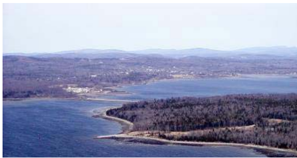
Long Cove and Stockton Harbor, 2007