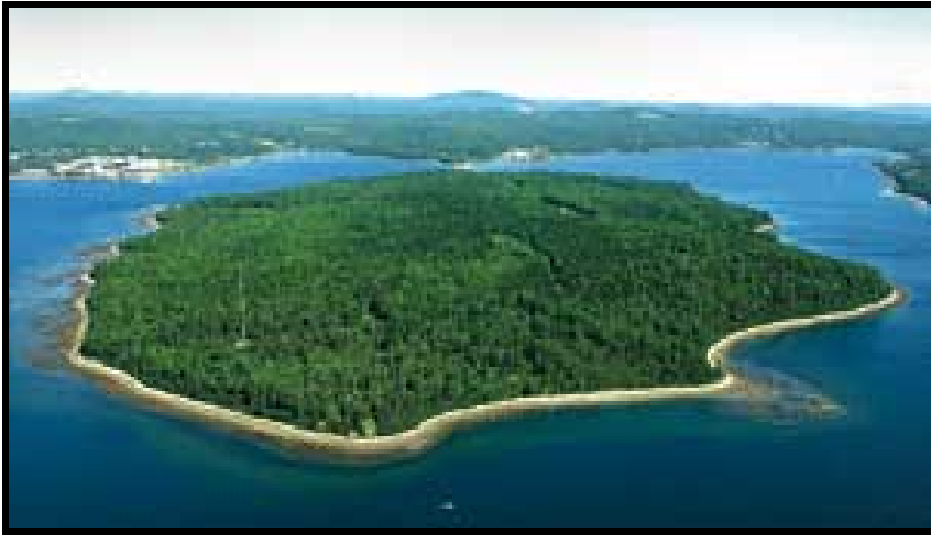
Sears Island, Searsport, Maine