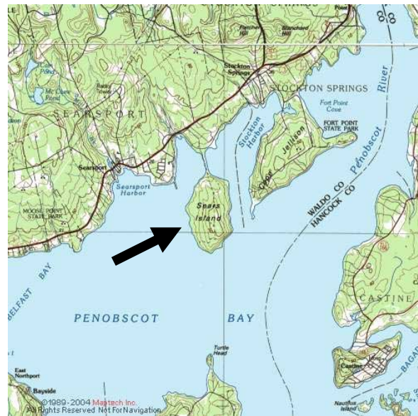
Figure 1: Location of Sears Island.

On the Maine coast, directly offshore of the Town of Searsport, lays the largest uninhabited island on the eastern U.S. seaboard. Although known to earlier inhabitants as "Wassumkeag" or "place of shining sands", the island is now known as Sears Island. This island is quiet and predominantly wild. It comprises 931 acres above mean high water bordered by five miles of coastline. It's high point of land is a central ridge rising to 185 feet above mean sea level, enhancing the island's visibility from numerous vantage points on and around Penobscot Bay. In addition to its unique history and character, Sears Island hosts a rich and diverse natural ecosystem. The ecological diversity that characterizes the island is in effect a microcosm of the unique Penobscot Bay ecosystem. It is Sears Island's unique natural and cultural character and history that makes a substantial portion of the island suitable for preservation.