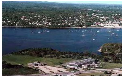
Belfast Harbor, 2007